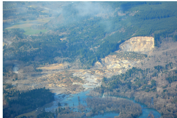
Top: construction underway on SR 530 following devastating Oso landslide (Bottom).