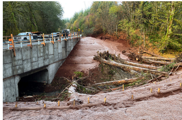
Top: immediately after clear-grub before construction of fish passage structure at Unnamed Tributary to Skookum Creek at MP 5.50 on SR 108. Bottom: completed fish passage crossing, stream channel and slope grading before plantings.