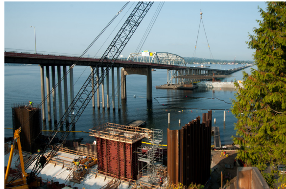
Construction of Pier 2 of the East Approach Bridge on a spread footing.