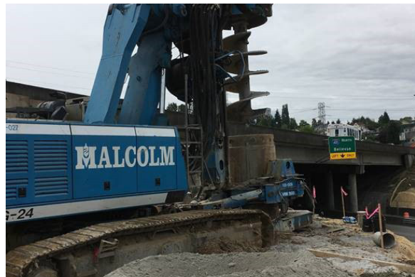
Top: oscillated drilled shafts being installed for the SR167 DC Flyover Bridge. Bottom: construction at the Talbot Road bridge widening.