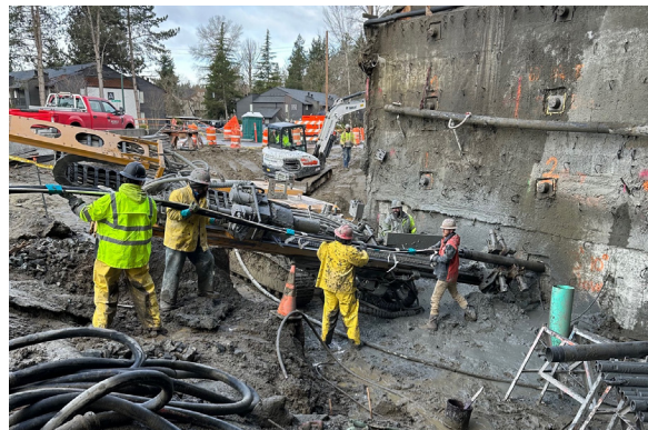
Construction of the tieback wall for fish passage below I-405.