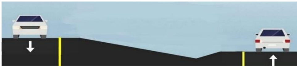
Exhibit 1232-3 Median Section without Median Barrier

[2] Overall median width and design will vary. See Chapter 1239 and Chapter 1610 .