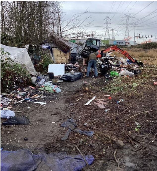
Encampment closed and cleaned by WSDOT along SR 512.