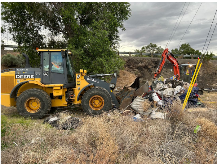
WSDOT using tools during encampment clean up keeping staff safe while being efficient to get the work done.