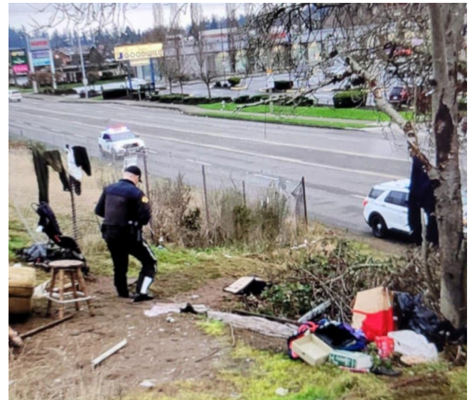
WSP officer supporting WSDOT at encampments along SR 512 & SR 509