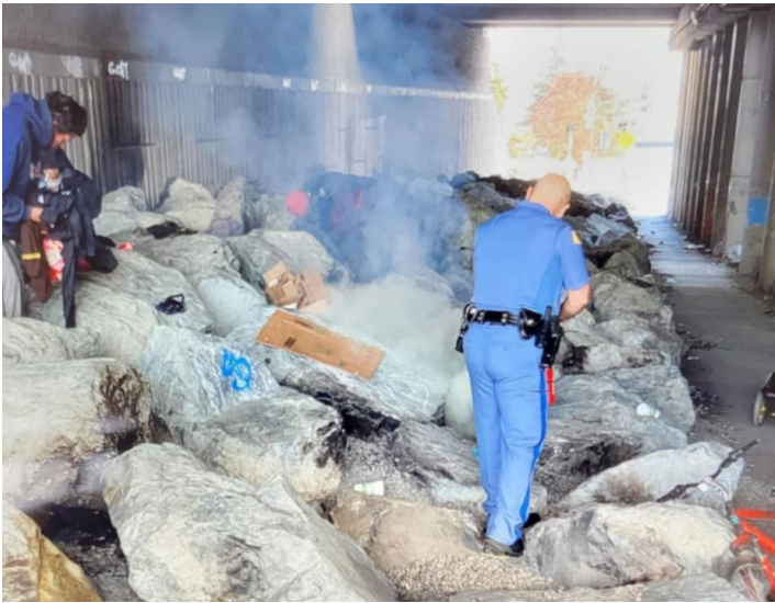
WSP officer supporting WSDOT at encampments along state right of way.

Jurisdictional, law enforcement and behavioral health partnerships are vital to lasting change and reducing the footprint of an encampment, with the goal of closing a known site altogether. Without this approach, people will often cut fencing to return to a cleared site or simply move to a new spot within hours of a cleaning a location.