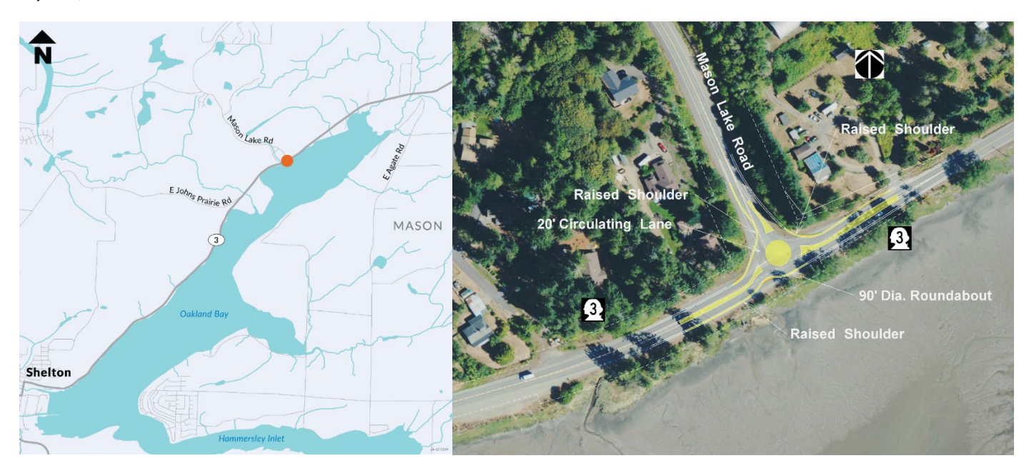
Image Description: Two maps showing the project location northeast of Shelton and the proposed roundabout alternative from a bird's eye view.