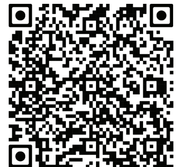
Scan to view the Community Planning Portal.